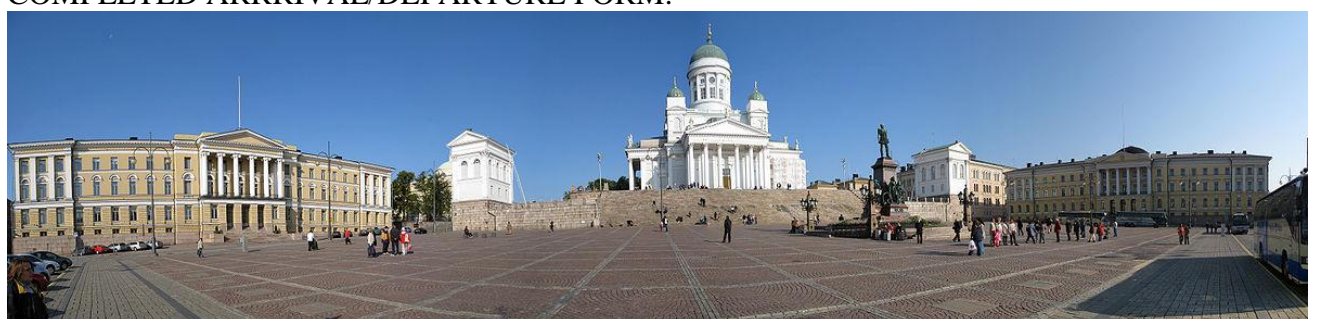
Helsinki's Senate Square

PLEASE NOTE: A RUSSIAN VISA IS NOT REQUIRED! UPON ARRIVAL IN ST. PETERSBURG YOU WILL RECEIVE A 3-DAY TOURIST PERMIT UPON PRESENTATION OF YOUR PASSPORT AND A COMPLETED ARRRIVAL/DEPARTURE FORM.