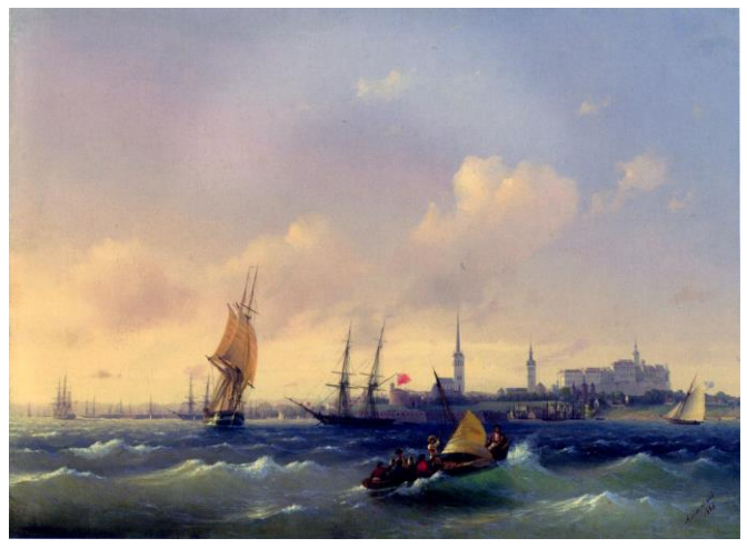
Tallinn seen from the sea, painting by Ivan Aivazovsky

<u>Day 10 - Wednesday, August 14</u>: After breakfast, transfer to the harbor in time for the departure of the ferry to Helsinki, situated just across the Gulf of Finland. The crossing takes about two hours. Arrival in Helsinki, and panoramic city tour, with as highlights the Lutheran Cathedral, the unofficial symbol of the city, the modern and very unusual Church in the Rock, the onion-domed Russian Uspenski Cathedral, the largest Orthodox church in Western Europe, and the Senate and Railway Station squares with their imposing buildings. Dinner and overnight in the centrally-located four-star Hotel Presidentti (https://www.sokoshotels.fi/en/helsinki/sokoshotel-presidentti).