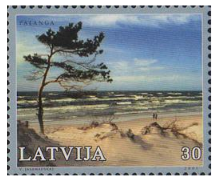
< The Baltic Sea on a Latvian stamp

in the heart of the old town, City Hall, Estonia's pink Parliament building, and Raekoda Street with its trendy shops. Afternoon free to explore on your own, shop, visit museums, etc. No group dinner this evening.